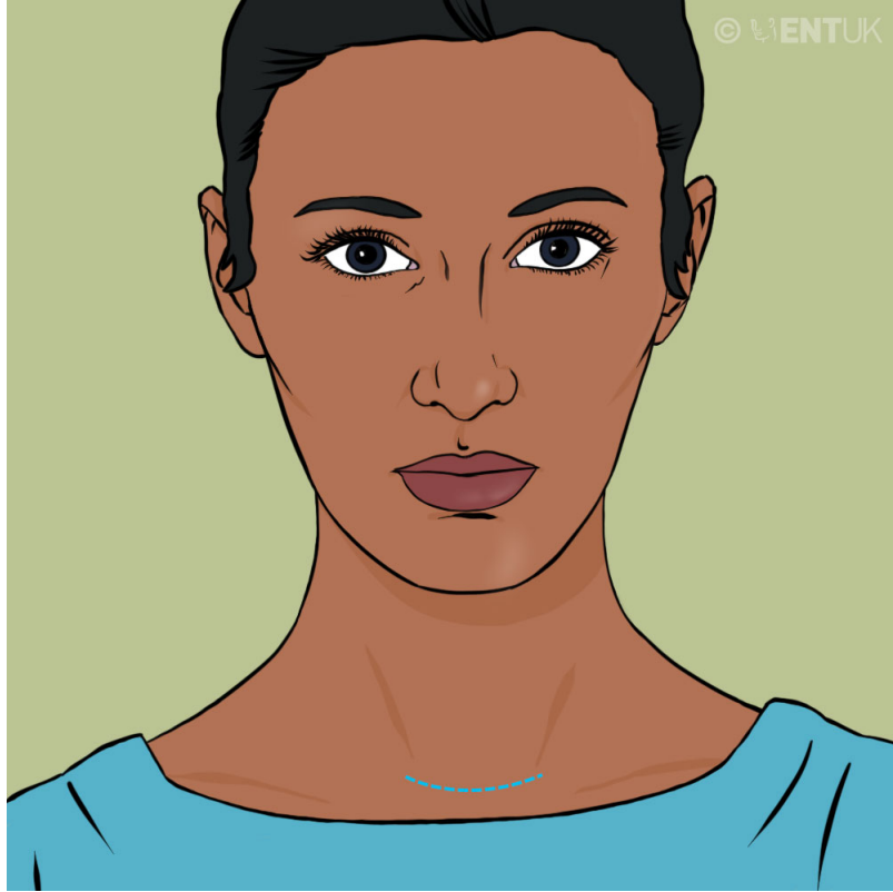
Figure 2. Location of the scar

The surgeon will find and protect the parathyroid glands and an important nerve called the recurrent laryngeal nerve. Sometimes one or more parathyroid glands are found within the thyroid gland itself. These have to be removed.